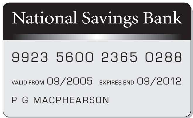
Your credit card